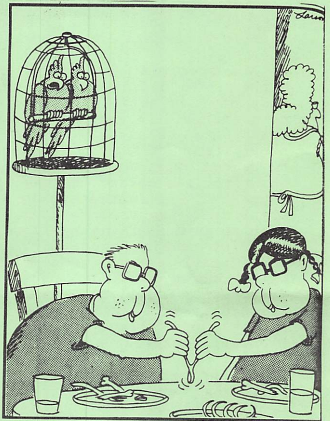
"Now here comes the barbaric finale."