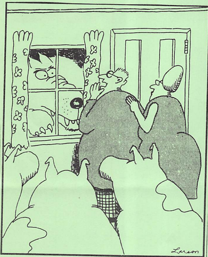
"Listen out there! We're George and Harriet Miller! We just dropped in on the pigs for coffee! We're coming out! . . . We don't want trouble!"