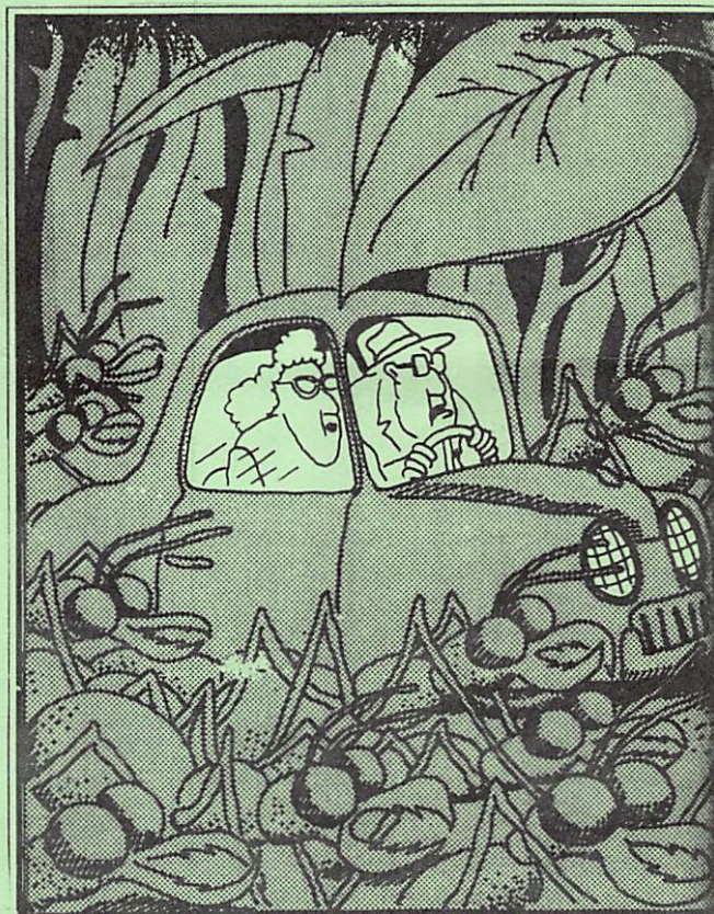
"Something's wrong here, Harriet . . . This is starting to look less and less like Interstate 95."